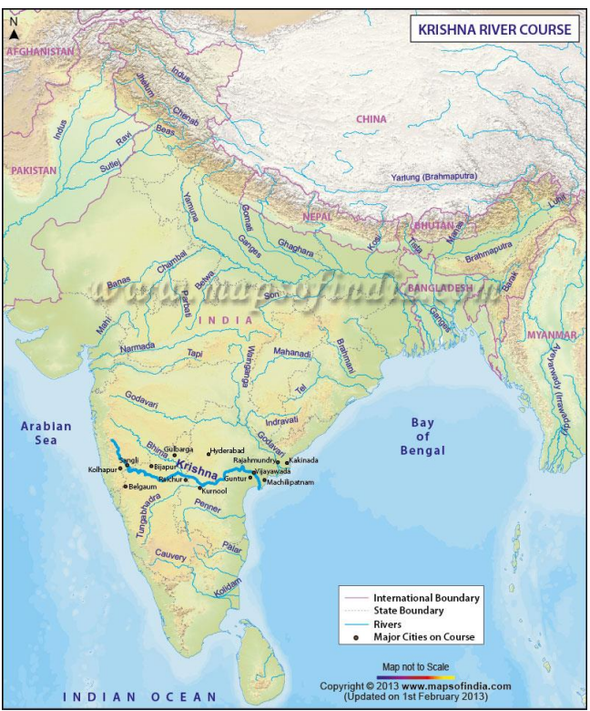
Figure 1: Location of Krishna River

The Krishna River is the second largest eastward draining interstate river in Peninsular India. It rises in the Mahadev range of the Western Ghats at an altitude of 1,337 m near Mahabaleshwar in Maharashtra State, about 64 km from the Arabian Sea. It flows for a distance of 305 km in Maharashtra, 483 km in Karnataka and 612 km in Andhra Pradesh before finally out falling into the Bay of Bengal. The length of the river is about 1,400 km Krishna basin lies between latitudes 13° 07' N and 19° 20' N and longitudes 73° 22' E and 81° 10' E. Drainage area of the basin is 258,948 km<sup>2</sup> [9] . The location of Krishna River has been shown in Figure 1.