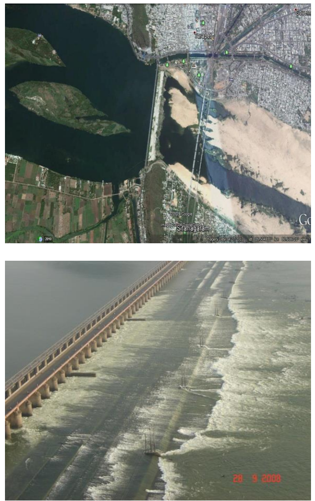
Figure 2: Location of Flow gage at Vijayawada station

The data has been collected with courtesy from Centre for Sustainability and Global Environment web site. The discharge site is Vijayawada (21.92 N, 73.65 E) and has been shown in Figure 2.