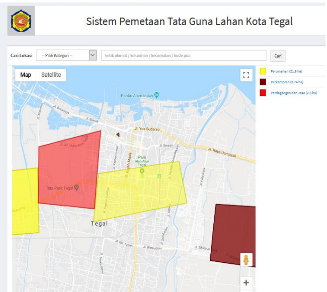
Figure 3 : Main Menu Land Use Mapping System [17]

By using PHP programming language and MySQL database, implementation of mapping system of land use area of Tegal city has been successfully made. The results of the research have been in accordance with the menu shown in the figure 3 and 4.