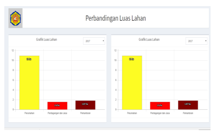
Figure 4: Graph Comparison Land area Menu [17]